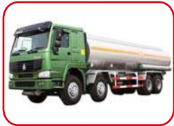
Diesel Gasoline Tanker