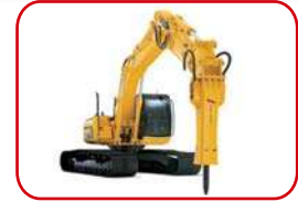
Excavator With Rock Breaker