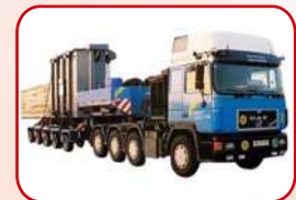
Primemover With Flat Bed