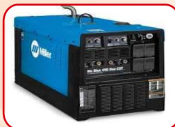
Motor Welding Machine