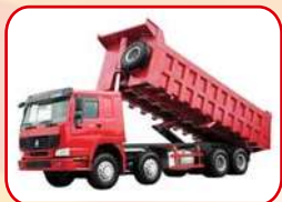
Trailer Dump Truck