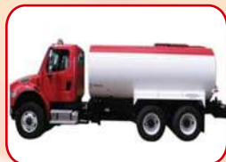
Sweet Water Tanker