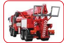
Truck with Crane