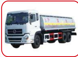
Crude Oil Tanker