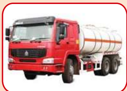
Raw Water Tanks