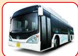
Bus 55 Seater